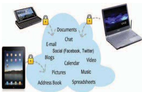
Figure 1. A Cloud Computing Scenario [7]

In this paper, we provide a comprehensive overview of interactive load balancing algorithms in cloud computing. Each algorithm addresses different problems from different aspects and provides different solutions. Some limitations of existing algorithms are performance issue, larger processing time, starvation and limited to the environment where load variations are few etc. A good load balancing algorithm should avoid the over loading of one node. The aim is to evaluate the performance of the cloud computing load balancing algorithms that have been developed over the period of 2004-2015. The rest of the paper is organized as follows. In section II, we compare review different load balancing algorithms. In Section III, the performance evaluation of different cloud computing algorithms have been discussed and evaluated with the help of multiple tables. Our discussion and findings are summarized and the paper is concluded in section IV.