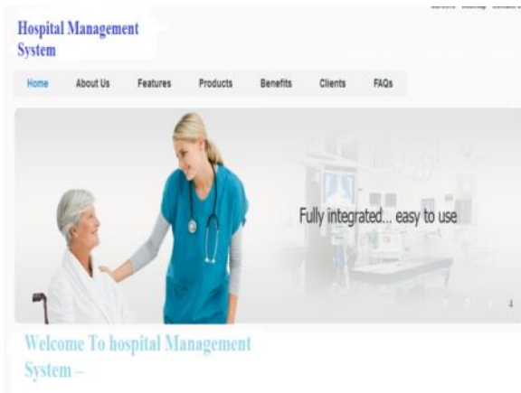
Figure 2: Generated Template for Web Page