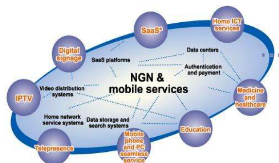
Figure 3. SaaS: Software as a Service: a service that provides software via a network

Italian telecom operators have signed a deal to build up a high-speed broadband network. The agreement will pave the way for a final deal for the deployment of a countrywide fibre-optic infrastructure. The operators, which have signed agreements on the technical model for the transition from the current copper network to fibre, will plan a combined private and public partnership to launch the high-speed network. Earlier in 2010, Italy's alternative operators, Fastweb, Wind and Vodafone, had planned to jointly invest €2.5 billion over a five-year period to develop fibre in Italy's 15 largest cities. Telecom Italia will not join any group and will separately offer 100 megabits per second broadband to 50% of the Italian population by 2018 and will put €9 billion in its network infrastructure by 2012.